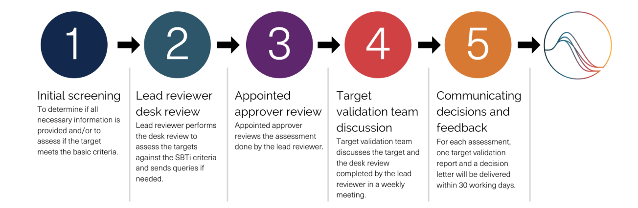
Figure 1. Visual process of validation stages